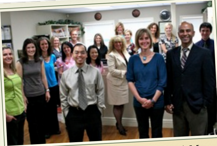
OUR INTEGRATED TEAM